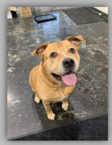
Sweet Sully is adoptable! Please refer a friend.